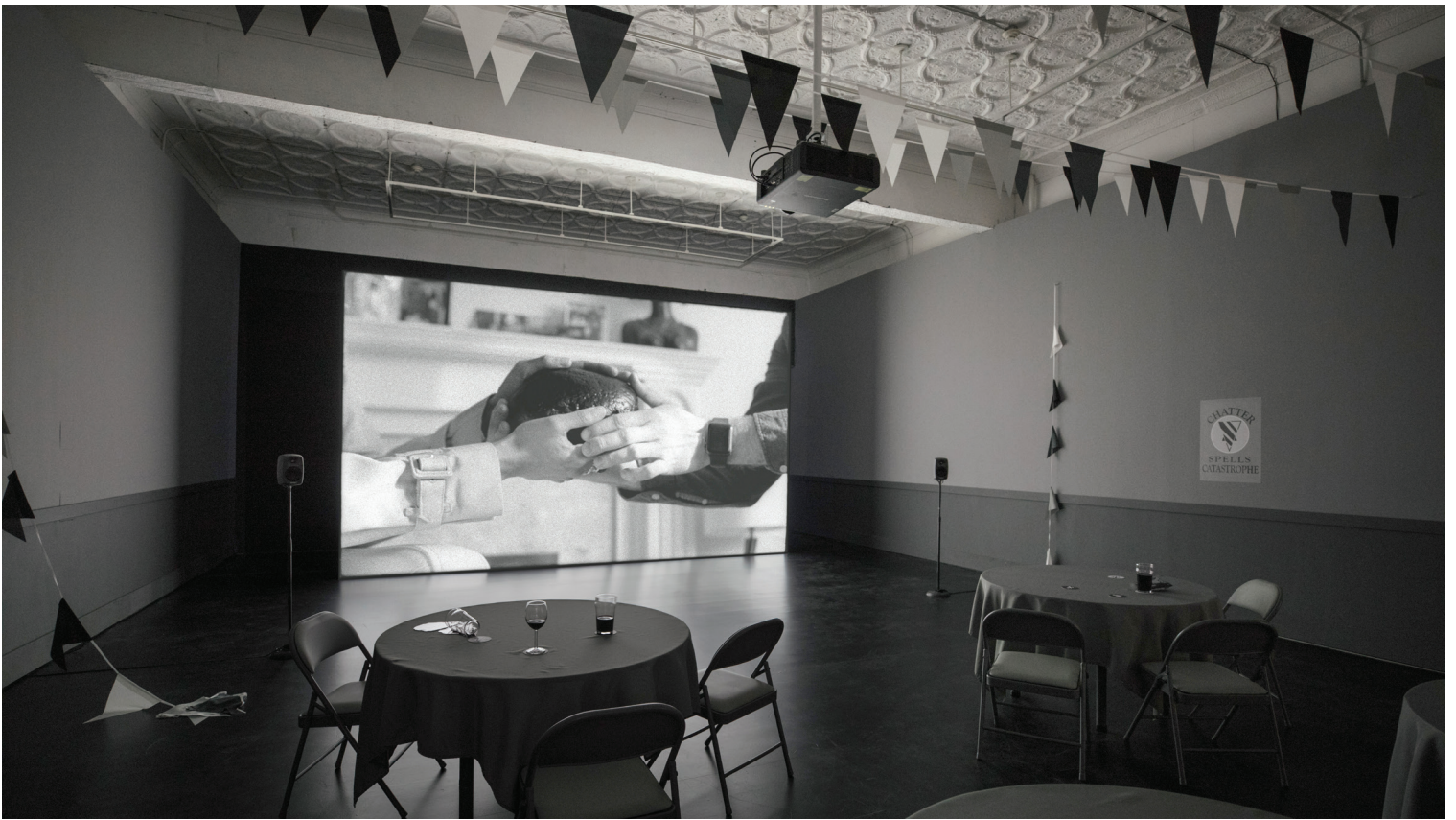
Danielle Dean: Out of this World . Installation view: Mercer Union, 2024.