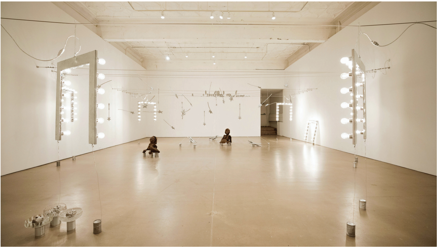
Rochelle Goldberg: Sun Moon Stars . Installation view: Mercer Union, 2023.