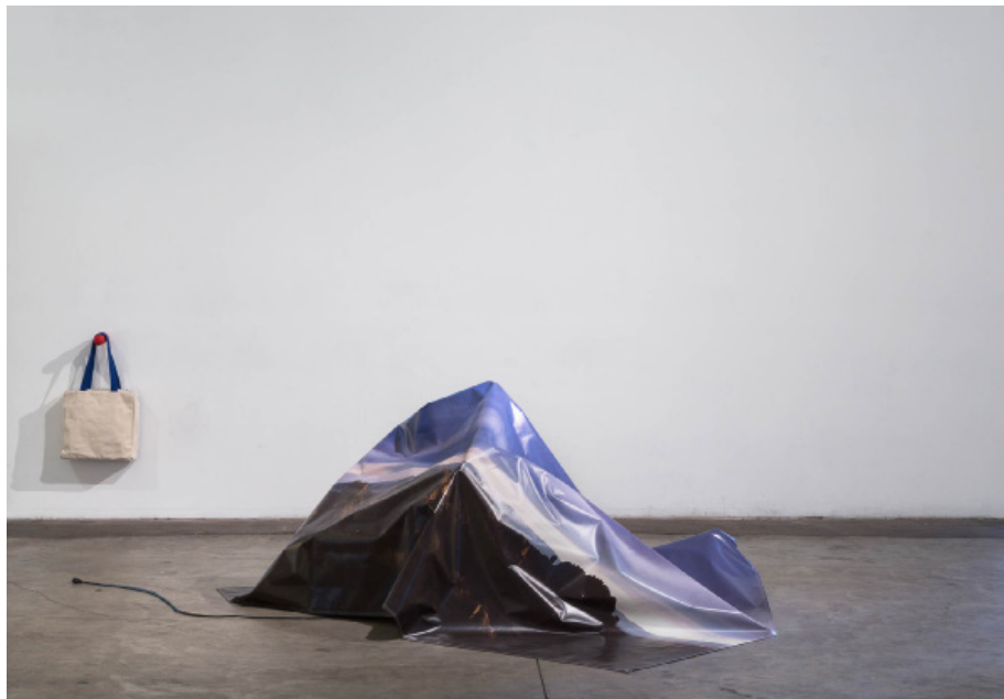
Steve Kado AGPTL:Office Tarp , 2016. Vinyl banner. Courtesy the Artist. Photo: Dawn Blackman.

Steve Kado's AGPTL:NZ (2016) is part of an ongoing series of landscape photographs printed on commercial-grade vinyl banners. It offers a view onto a portion of MacArthur Park from the building that houses his studio in Los Angeles. Temporarily located in the city where the artist was born and raised, a displaced view from his here becomes our elsewhere. A soft sculpture of sorts, the flexibility of its material guides the final form of AGPTL:NZ , as it responds to extant architecture and art objects alike. Retaining its integrity as a single object, here the interweave does not emerge from a series of segments. Instead every edge of the banner is an unfinished seam that marks the distance between his production site and our exhibition site.